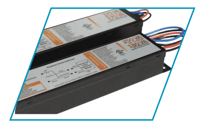
High Voltage Transformers High voltage transformers allow the fixture to receive a higher power input of 347V-480V.