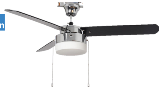
ECF Series 52' Sweep

The ECF series are a family of ceiling fans featuring a simple 3 blade design. The clean lines and modern design of this AC Motor LED fan makes an elegant addition to your contemporary home décor. The reversible feature makes this fan perfect to use during every season.