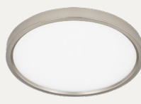
BN- Brushed Nickel