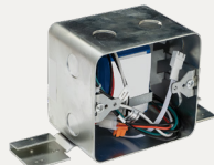
EML-JB-AC2 (Sold Separately)