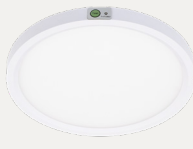
RDL w/EMTB (Test Switch)