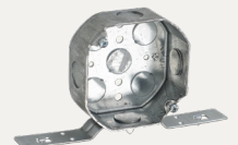
4" Octagon / V Bracket